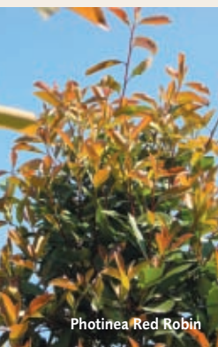
Photinea Red Robin