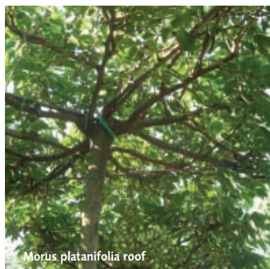
Morus platanifolia roof