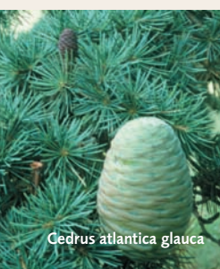
Cedrus atlantica glauca