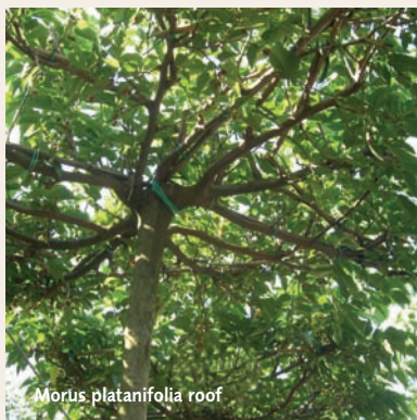
Morus platanifolia roof